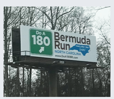
For more information, visit Doa180BR.com.